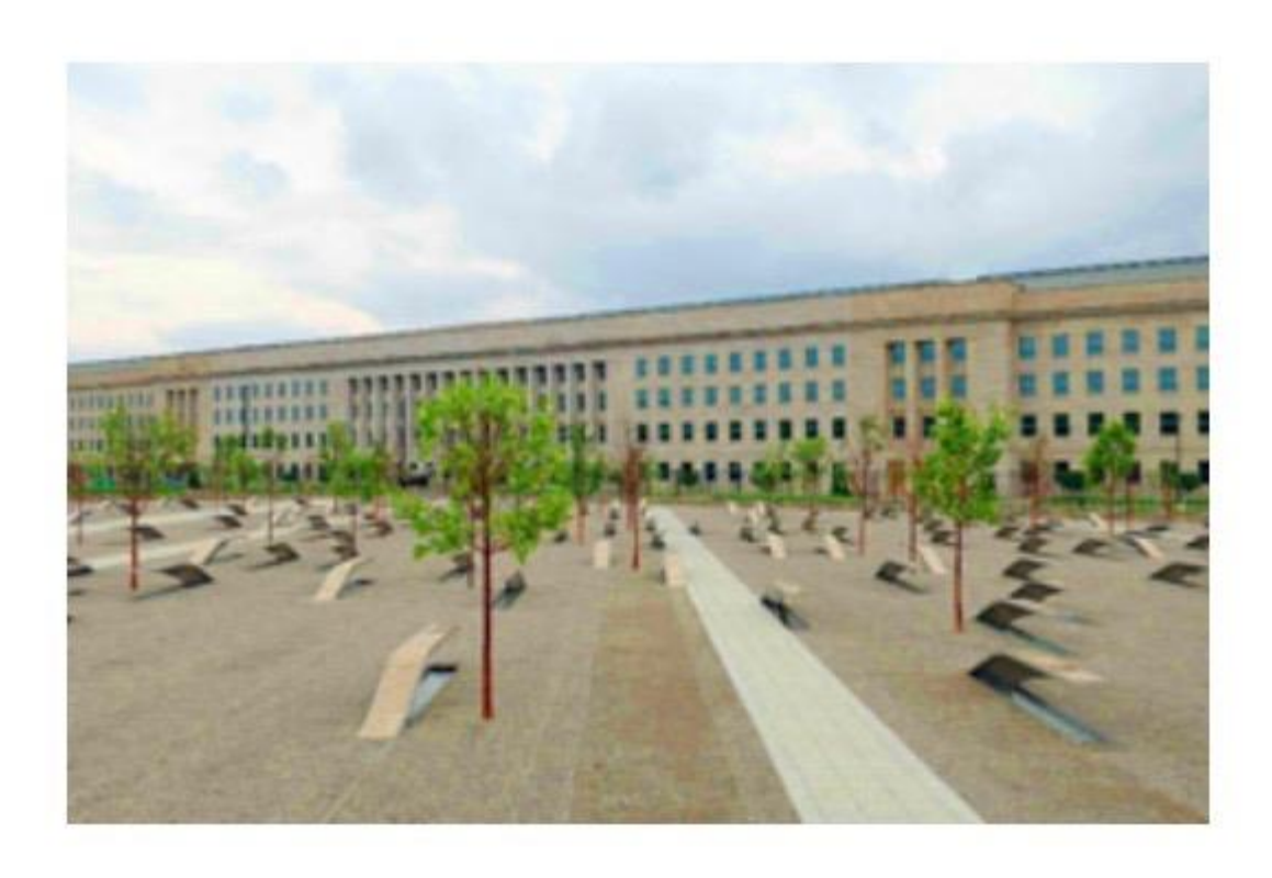
When completed, we added a virtual tour of the Pentagon Memorial Park